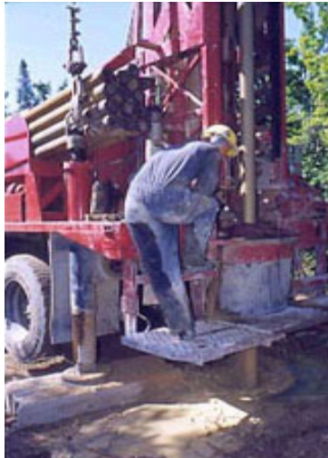
Sealing Unused Well

quality of your water, your neighbor's, or the City's. If contamination levels reach high enough thresholds it may require the installation of a water treatment system or the drilling of a new well. Both of these items may cost thousands of dollars.